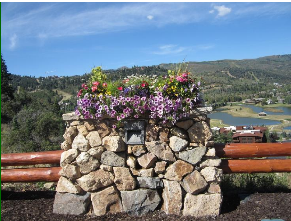
Entrance Roadway Decor

This past summer we once again crack sealed the entire development, which helps keep water of the pavement and increases the life span. Several areas were cut and patched, and the bridge by the Hotel was over-laid with new asphalt. All the cul de sacs connected to Summit Drive were slurry sealed, as well as the upper portion of Summit Drive. Numerous areas where the concrete gutter was cracking were replaced. Next year we are planning to slurry seal larger portions of the roads. As usual, please watch out for workers in the road!